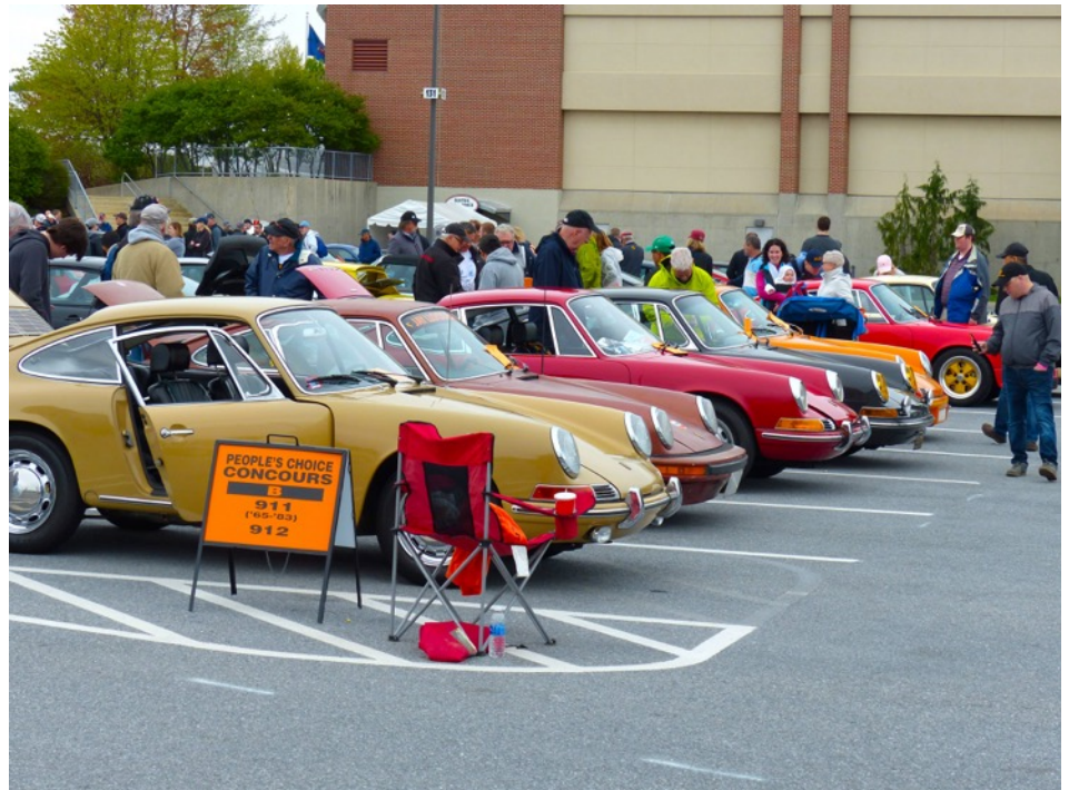
Top: People's Choice concours was one of the favorite attractions. Here are a group of early 911s and 912s.

Rain moved in later in the afternoon and became steadier during our return drive. Cars looked pretty dirty when arriving home, providing a real reason to wash.