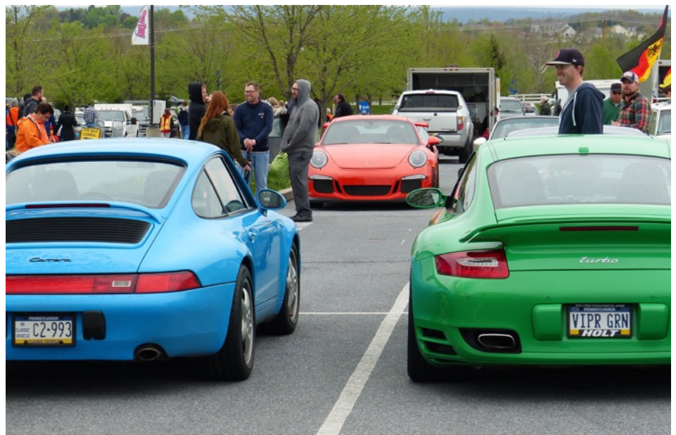
Right: Cars on display showed the full color spectrum.