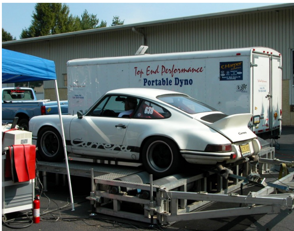
Once the Club Car is complete we might have to dyno it to see how it does.